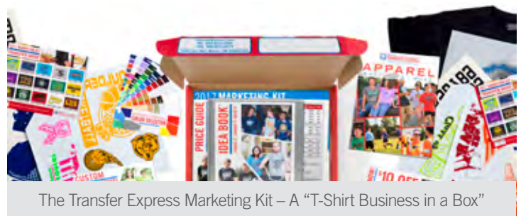
The Transfer Express Marketing Kit – A “T-Shirt Business in a Box”