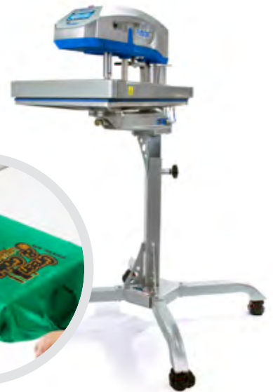
Hotronix® Fusion® Heat Press